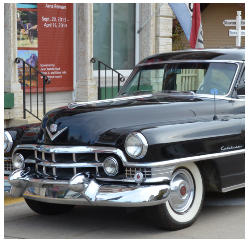
King Olav’s 1951 Cadillac returned to Norway into the care of the American Car Club of Norway (AMCAR).