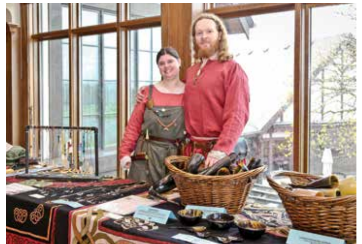
Red Bone Adornments, vendors at Nordic Celebration & Marketplace.