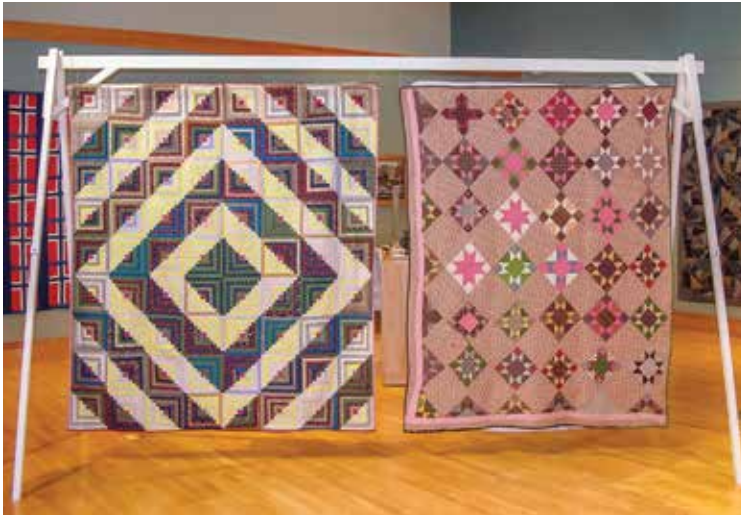
Vesterheim's Pieces of Self: Identity and Norwegian-American Quilts exhibit is on display at Livsreise in Stoughton, Wisconsin. Vesterheim and Livsreise have a partnership to provide exhibitions and projects to benefit the Center's visitors and beyond.