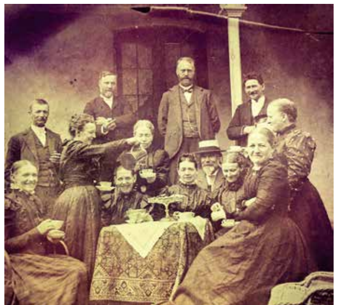
This fun photo from our archival collection is an example of the important work being done with support from the Bryant Foundation in Stoughton, Wisconsin, and in cooperation with Luther College and Nordic Archives.