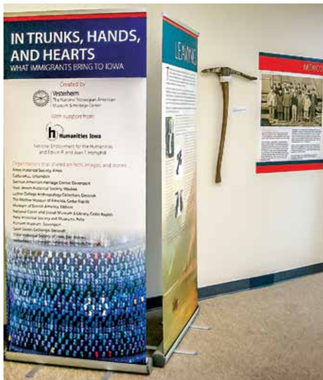
Two of the seven banners for In Trunks, Hands, and Hearts , Vesterheim's traveling exhibit portraying images and stories about immigration to Iowa. Sponsored by Humanities Iowa.