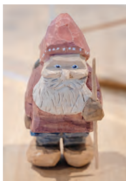
Socially Distanced, Creatively Connected , a juried folk-art exhibition highlighting pandemic creativity, showcased 82 entries including disciplines like knitting, embroidery, and jewelry. Entries came from 16 different states and included work from artists ranging from 10 to 90 years old. This piece, "Tomte," was submitted by artist Benjamin Stracke, age 10, of Midland, Michigan. This figure carving is now part of Vesterheim's collection.