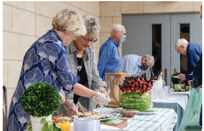
Pictured are several members of the volunteer hospitality committee, who regularly host beautiful receptions to celebrate Vesterheim exhibits and other events.