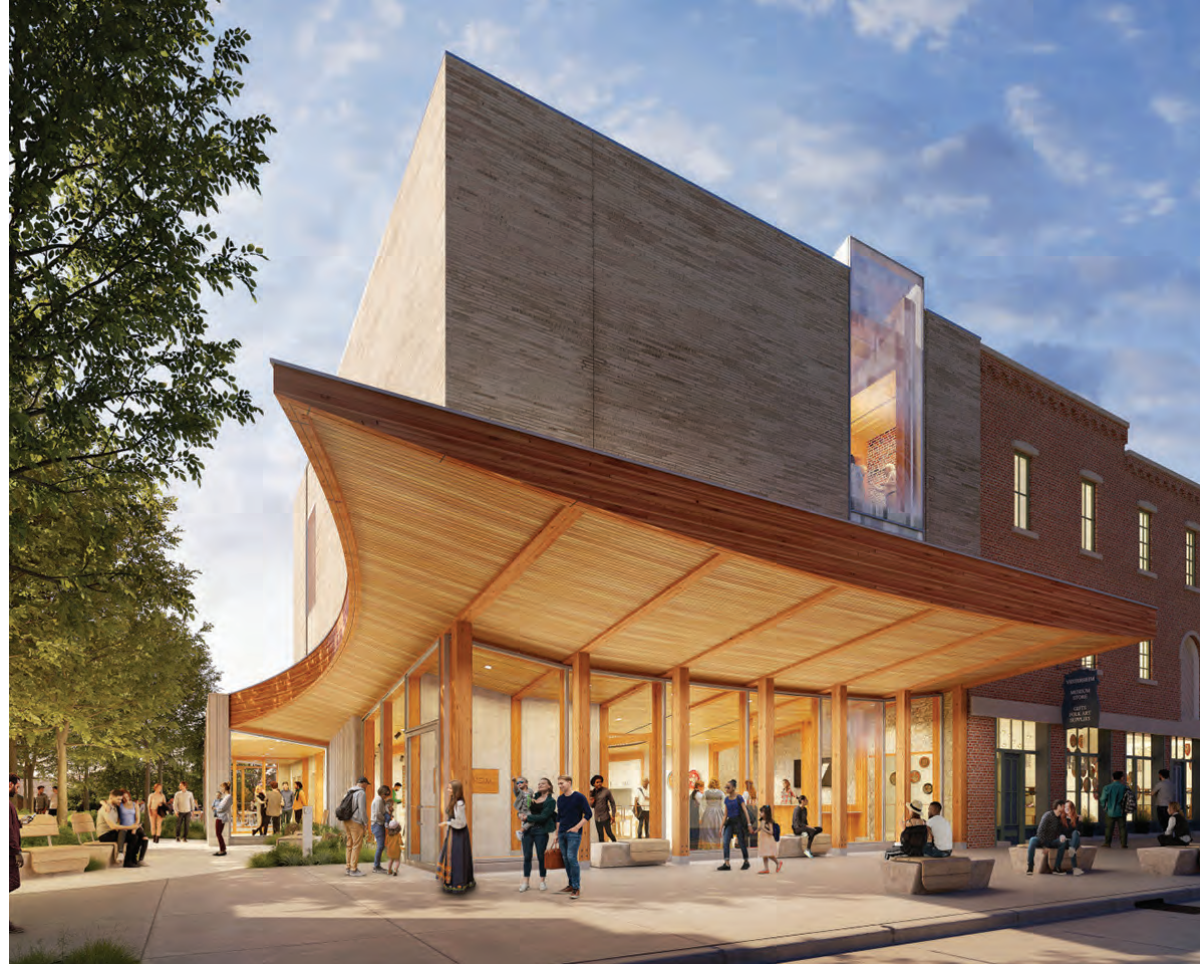
Design by Snøhetta.