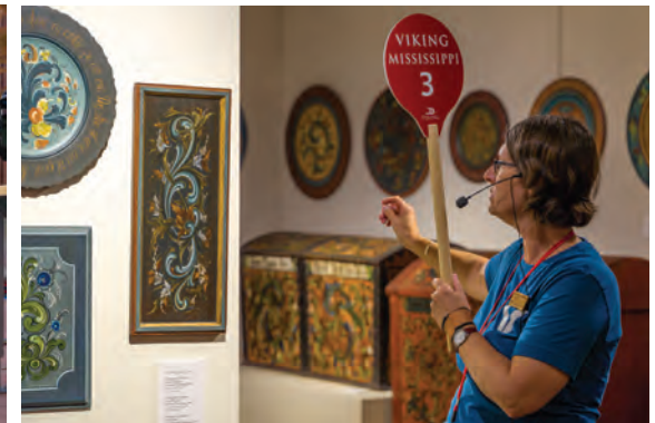
Vesterheim has built a partnership with Viking. Starting in summer 2022, their Mississippi River cruise guests traveled to Decorah and Vesterheim for guided tours and folk art experiences.