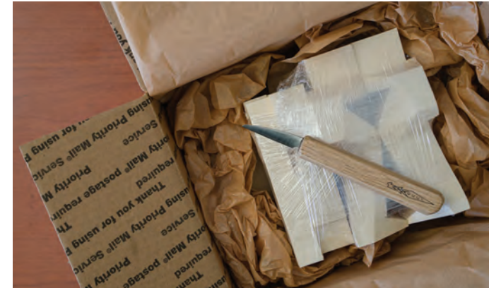
1,500 kits of tools and materials to aid student learning were packaged and sent for Folk Art School classes and programs in 2022.

“Excited to learn about traditions and arts, as well as history about Norway. Feel as though I missed my calling for the arts, but am grateful to experience them now through the museum.”