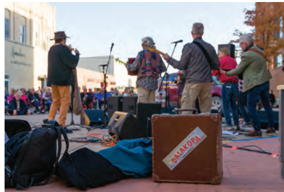
We had so much fun hosting the band DALAKOPA from Norway in September. Over 300 people enjoyed their tunes and stories, and some even enjoyed dancing along, including young folks doing the schottische!