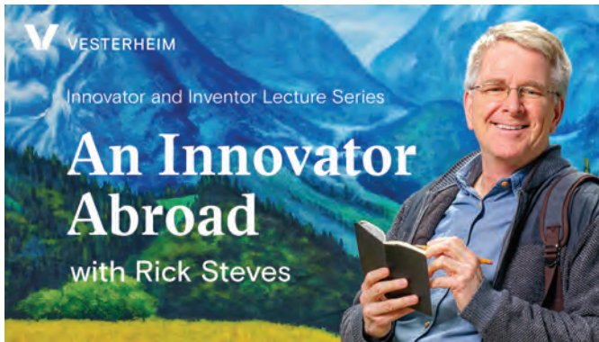
Vesterheim's most-watched webinar in 2022 was part of the Innovators & Inventors Lecture Series, An Innovator Abroad with Rick Steves .