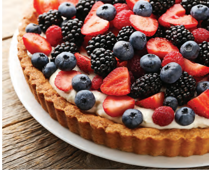
Vesterheim’s Nordic Cooking classes are supported in part by the Oneota Community Food Co-op.